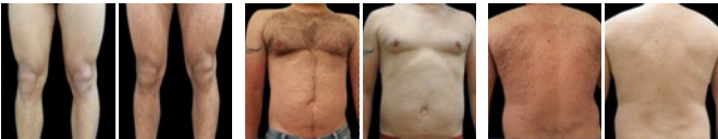
Before and after treatments

Please note: an essential patch test at the cost of £20 must be carried out prior to any treatment to determine Laser effectiveness and suitability for your skin. This cost is redeemable against the purchase of future Laser treatments.