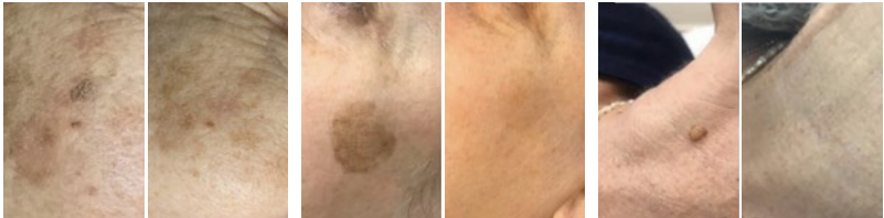
Before and after treatments