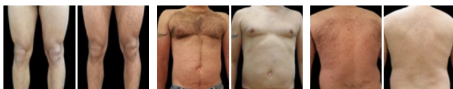
Before and after treatments

Please note: an essential patch test at the cost of £20 must be carried out prior to any treatment to determine Laser effectiveness and suitability for your skin. This cost is redeemable against the purchase of future Laser treatments.