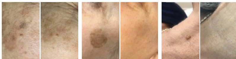
Before and after treatments