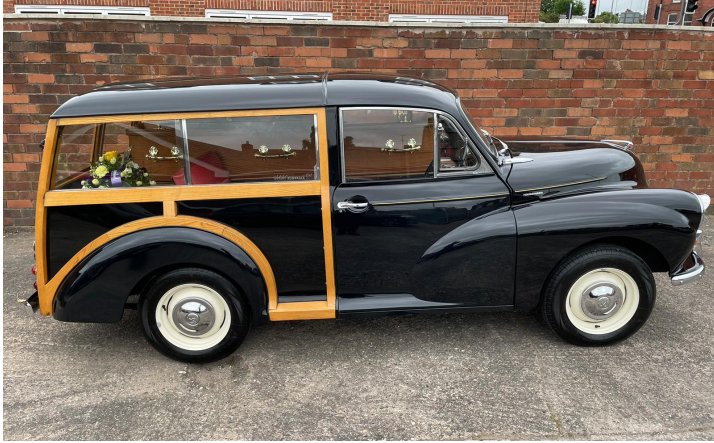
CUV at Radcliffe

The Morris Minor hearse made an appearance at Rainworth.