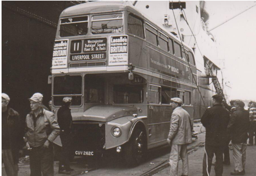
The bus at the side of a ship in Boston in 1965

The bus is an original London Transport 1965 Routemaster Long Wheelbase and had the fleet number RML 2262. It can take up to 48 passengers with a coffin or 72 passengers with no coffin.