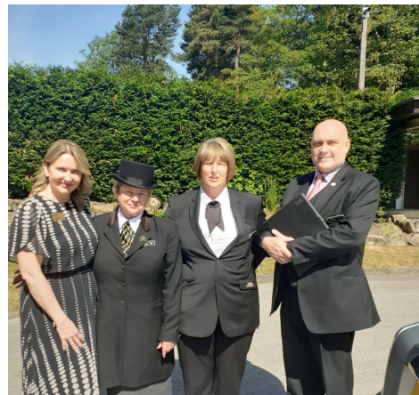
Having a break!