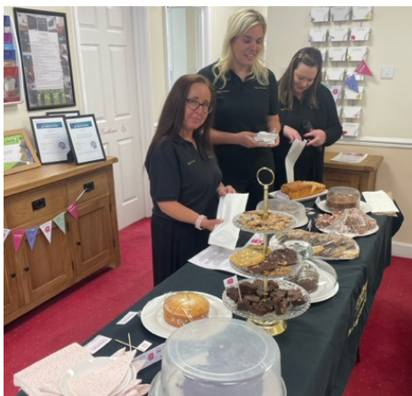
QMC Bereavement Centre