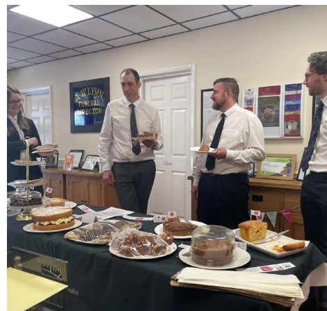
95 Years Young