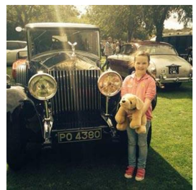
A.W. Lymn Rolls-Royce Phantom II Vintage Limousine Showcased at Stapleford Carnival 2015

To receive the 'New Horizons Breaking News' email updates during the month as they happen, Simply visit our website www.lymn.co.uk and click on the subscribe button at the bottom of the home page.