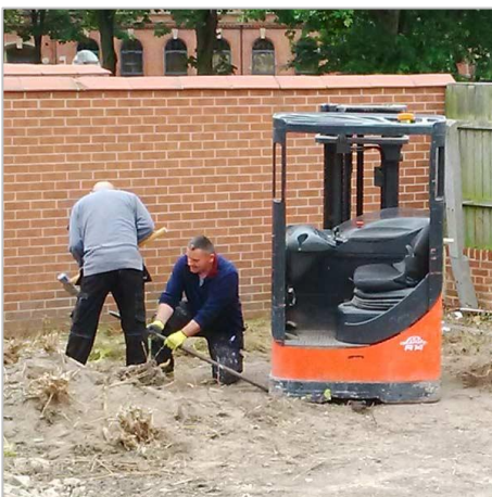
A lesson in skilful fork-lift truck precision placement from the maintenance team