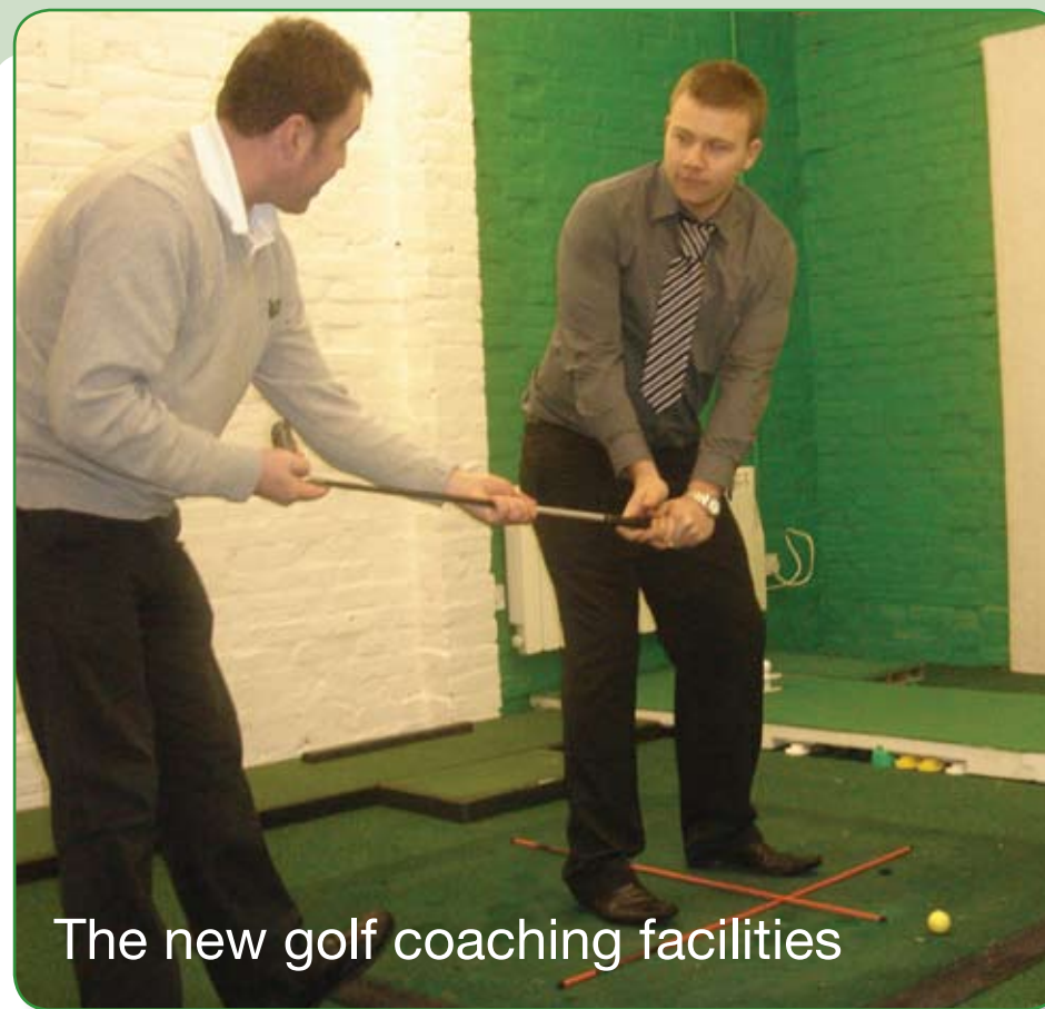
The new golf coaching facilities